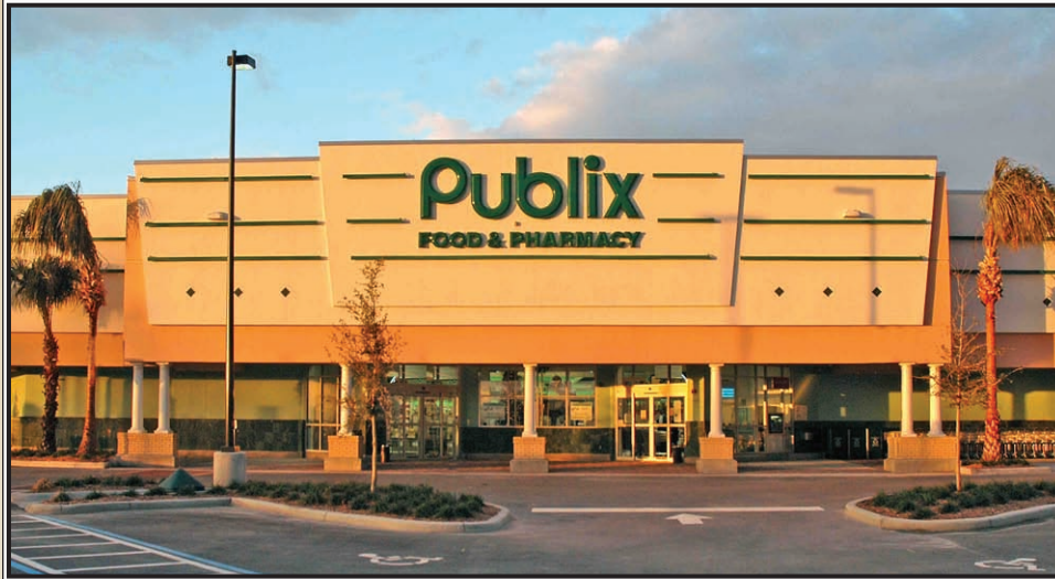
Publix At Avalon Park • Avalon Park Boulevard & Tanja King Boulevard • Orlando, Florida

Publix at Avalon Park is located on the north side of the intersection of Avalon Park Boulevard and Tanja King Boulevard in Orlando, Florida.